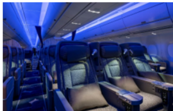
Premium Economy Class